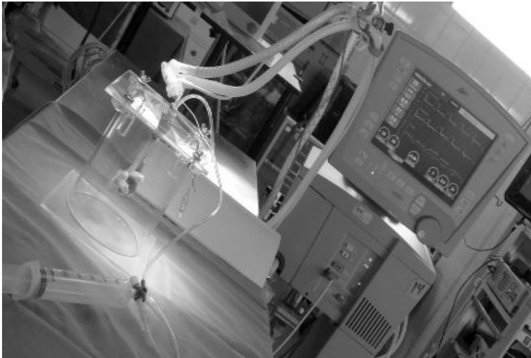
FIGURE 2: TO IMPLEMENTING THE TEACHING AND LEARNING PROGRAM, THE BLOCKS WERE PLACED INSIDE THE ACRYLIC BOX AND CONNECTED THROUGH AN ENDOTRACHEAL TUBE TO A VENTILATOR. THE LUNGS WERE INSUFFLATED UNDER FOUR DIFFERENT INSPIRATORY PRESSURES (10, 12, 14 and 16 cmH 2 O), AND THE COMPLIANCE RATIO (C20/C), INSPIRED TIDAL VOLUME (Vti), AIRWAY RESISTANCE (RAW) AND PERCENTAGE OF LEAKAGE WERE OBTAINED FOR EACH OF THE INSPIRATORY PRESSURES.

compliance ratio (C20/C), inspired tidal volume (Vti), airway resistance (Raw) and percentage of leakage were obtained for each of the inspiratory pressures.