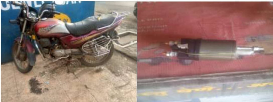
Fig.3.1: Bike And Electromagnetic-Coil