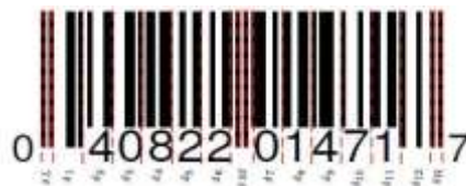
Figure(2): UPC-A barcode, encoding 12 digits

1D-barcode patterns are characterized by a rectangular array of parallel lines. The particular symbol we focus on in this paper is UPC-A, which is widespread in North America and encodes a total of 12 decimal digits (one of which is a checksum digit that is a function of the preceding eleven digits). The UPC-A pattern contains a sequence of 29 white and 30 black bars, for a total of 60 edges of alternating polarity.