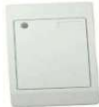
Fig 2. RFID reader