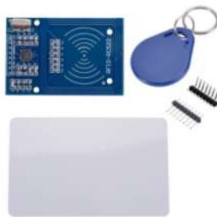
Fig.4.2 Arduino Uno Chip & RFID Tag