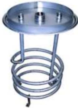
Fig.4.3 Heating Coil