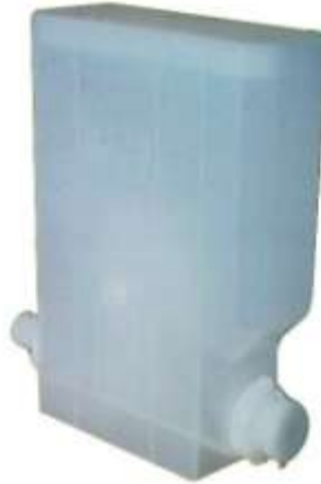
Fig.4.4 Plastic Container