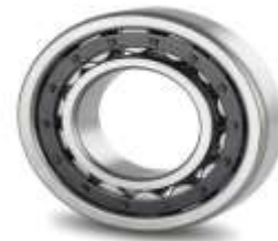
Fig. 2 Roller Bearing SKF6000