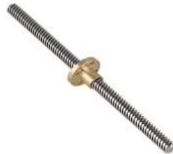
Fig. 1 Threaded Rod of 5 mm radius