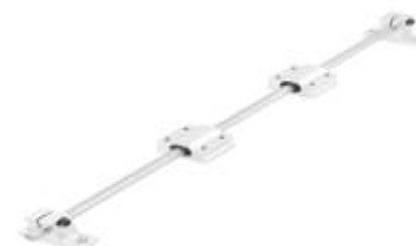
Fig. 3 Sliding Rod