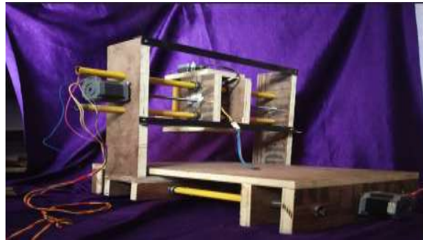
Fig. 6 Actual Working Model