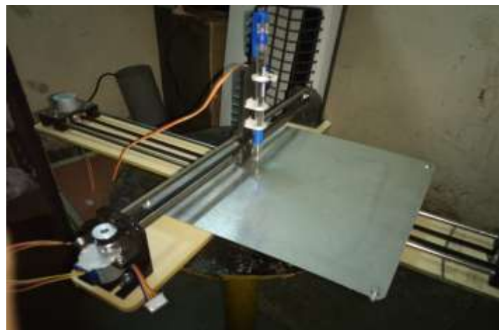
Fig.3 Braille Printer.

The Braille Printer is very convenient and it easily prints the given input characters and it is very satisfying. Efforts are taken to make it as reliable as possible to give the blind people a very optimum result.