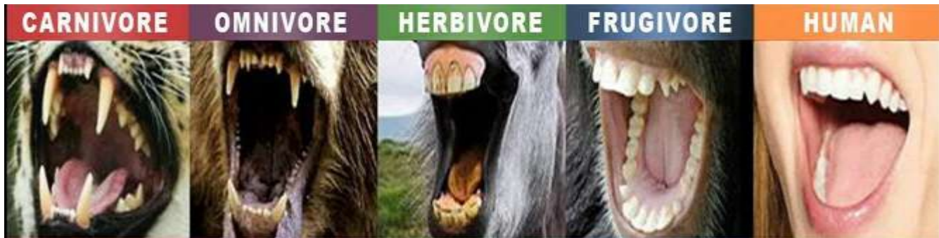
Fig. 1 Teeth arrangement of Mammals