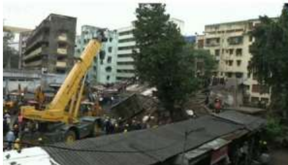
Fig.2 Residential Building Collapse, Mumbai, India