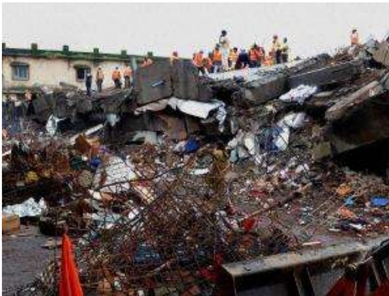
Fig.3Thane Building Collapse, India

A building collapsed on 4 April 2013 in Mumbai a place near to Thane in Maharashtra, India .It was one of the worst disaster among the building collapse. The death has raised to 74 people (including children) died.The builders, engineers, municipal officials and other responsible parties were arrested as the building was occupied without an occupancy certificate. Around 100to 150 families from middle income group were residing in the building.