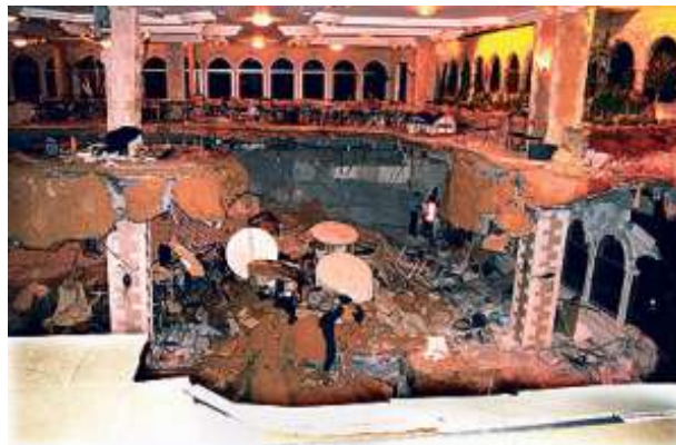
Fig.1 Versailles Wedding Hall, located in Talpiot, Jerusalem

Many buildings collapsed across the world, some deadlier than others, happened throughout the history. Unfortunately, throughout history there has been many building collapses across the world, some deadlier than others. There are a wide variety of causes, from bomb explosion causing a chain reaction that collapses the building, to poor maintenance. But all of these collapses have the same deadly end result. The only positive is that we have been able to learn from the mistakes of the past and begin to build stronger, sturdier buildings, in order to minimize the deaths from such collapses