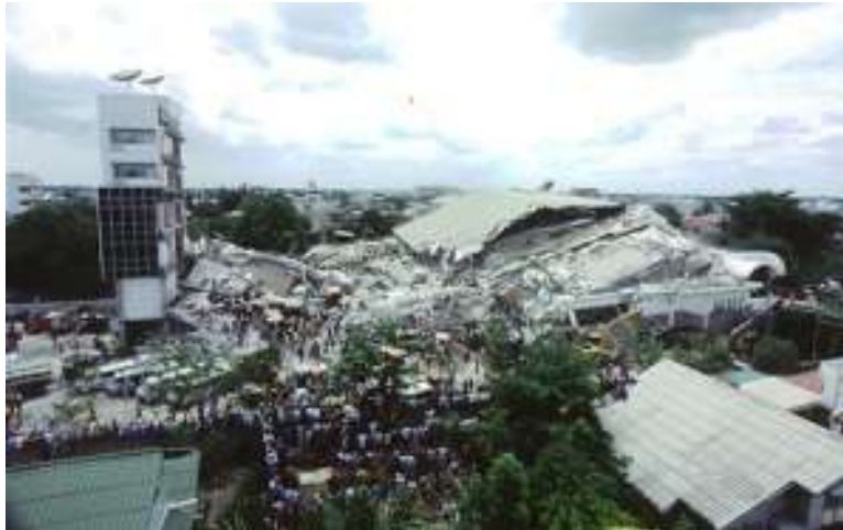
Fig.4 Hyatt Regency Walkway, Kansas City, Missouri