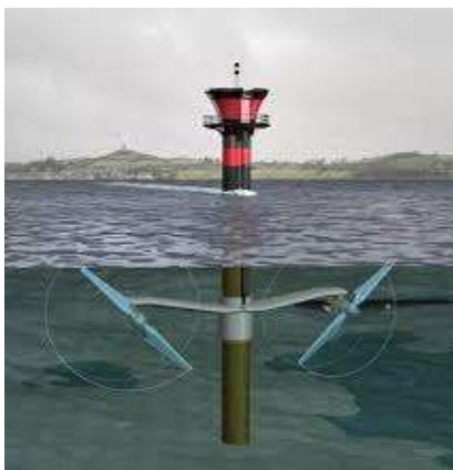
Fig. 2 Horizontal axis

As the blades spin, a gearbox turns an induction generator, which produces an electric current. In addition being renewable, another advantage of oceans is that it's reliable. As sea water has high density as that of the wind ocean currents carry more energy. This has lesser impact on the environment leading to less hazardous. Water is 832 times denser than air and consequently tidal turbine rotors can be much smaller than wind turbine rotors thus they can be deployed much closer and together, still generates same amount of electricity. Ideal locations for tidal farms are close to the shore in water depths of 20-30 meters (65.5-98.5) feet. Later on the potential energy of stored water was used for powering a bulb turbine, generating electricity. Comparing with wind and wave energy both are the intermittent energy. The tidal current has some advantages due to which this energy are more attractive and is compatible with the environment. Therefore, many countries around the world are doing the research works in this field. On this basis, the tidal current energy is converted into mechanical energy and that mechanical energy into electrical energy. The converters are then categorized into main two types: