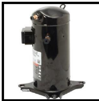
Fig. 2.1 Rotary compressor