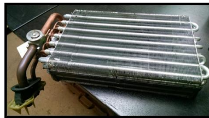
Fig. 2.3 Evaporator Coil

4. Evaporator coil: - An evaporator coil, also called the evaporator core, is the part of the system where the cooling occurs. Evaporator coils are made from good heat conducting materials like copper, steel, and aluminium. A panel is made up of some U-shaped tubes. Thin pieces of metal are aligned in this panel to increase the surface of the coil.