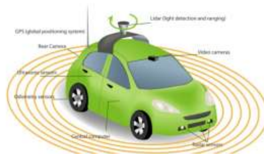
FIGURE 2: Google waymo consists of different sensors

Following are the technology used in Google self-driving car: