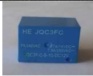
FIGURE 5: Relay