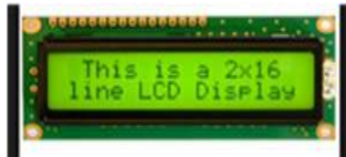
FIGURE 4: 2*16 LCD Display

LCD (Liquid Crystal Display) is the technology used for displays in notebook, TV & other appliances. Like LED and gas-plasma technologies, LCDs allow displays to be much thinner than cathode ray tube (CRT) technology. It displays the Energy Meter reading units and balance. A 16X2 LCD is connected with microcontroller at 7,8,9,10,11 and 12 pins to display the reading of varied sensors.