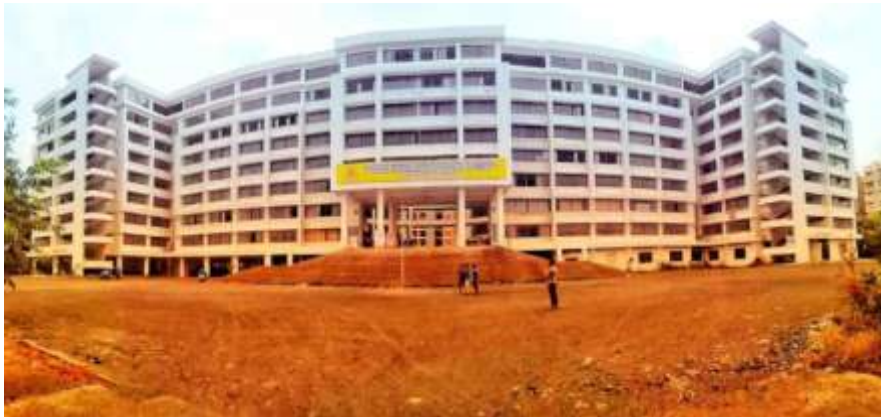
Figure No. 1 Ground of New VIVA collage

The site selection for the construction of underground structure lies in Virar west. Ground of New VIVA college is selected for our project.