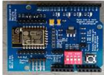
FIGURE 3: ESP8266 WiFi module

It is a low cost chip with TCP-IP stack and microcontroller. In our project main importance role of wifi is it performs IOT operation. The simple device is connected from microcontroller to send the information wireless.