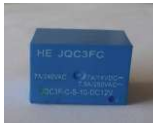
FIGURE 5: Relay

Single pole double throw (SPDT) relay is connected to port RB0 of the micro controller through a driver transistor (Q1). The relay requires 12 V at a current of around 100 mili amps, which cannot provided by the micro controller. So the driver transistor is added. A relay is an switch that uses an electromagnet to move the switch from the off to on position instead of a moving the switch. It takes relatively a small amount of electrical power to turn on a relay but the relay can control something that draws much more power. The relay is used to operate external electronic lock, safety switch or any other electrical device ETC.