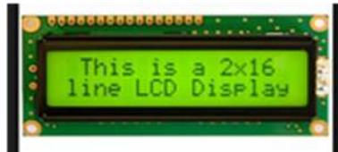
FIGURE 4: 2*16 LCD Display

LCD (Liquid Crystal Display) is the technology used for displays in notebook, TV & other appliances. Like LED and gas-plasma technology, LCDs allow displays to be much thinner than cathode ray tube (CRT) technology. It displays the Energy Meter reading units and balance. A 16X2 LCD is connected with microcontroller at 7,8,9,10,11 and 12 pins to display the reading of various sensors.