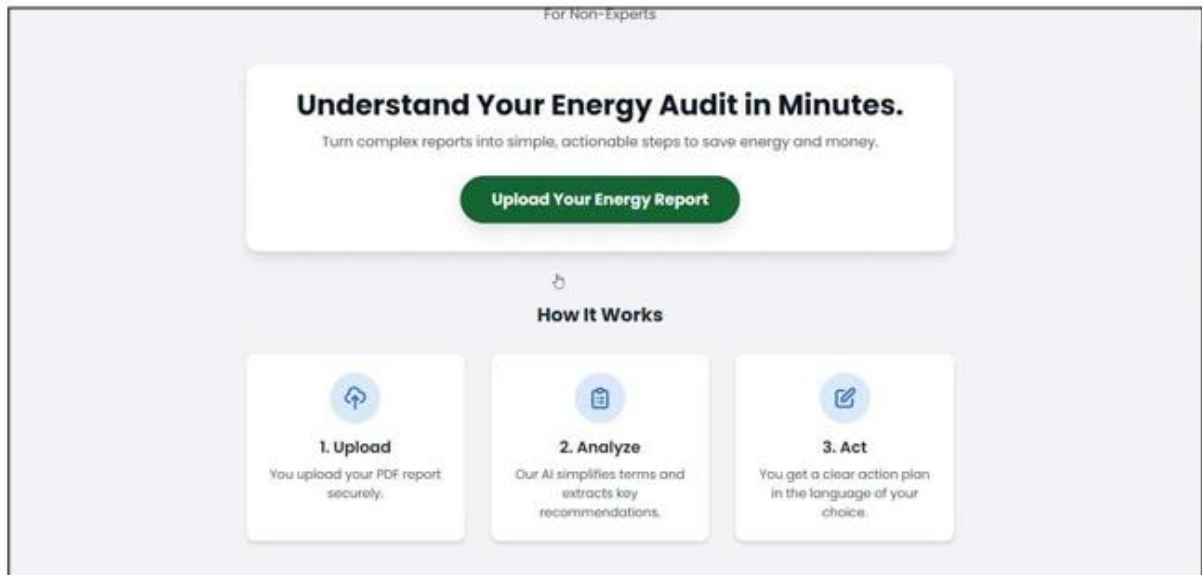
Figure 2: Website View - First Page

The output of the proposed system includes a concise summary of audit findings, a simplified glossary of technical terms, and a prioritized action plan. Testing with sample audit reports shows that non-expert users are able to understand recommendations more easily and demonstrate higher willingness to implement suggested measures. The tool effectively bridges the communication gap between energy auditors and end users.